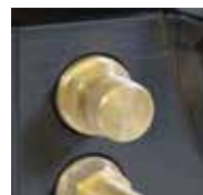
TEST button feature for routine testing.