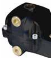
Three inlet options for easy installation.