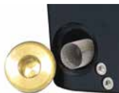
Integrated strainer to protect the valve