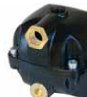
Sight port optionally available.