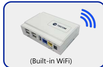
IoT Gateway x1