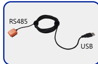
Smart Vibration Sensor x 2