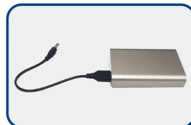
Mobile Power Pack x 1