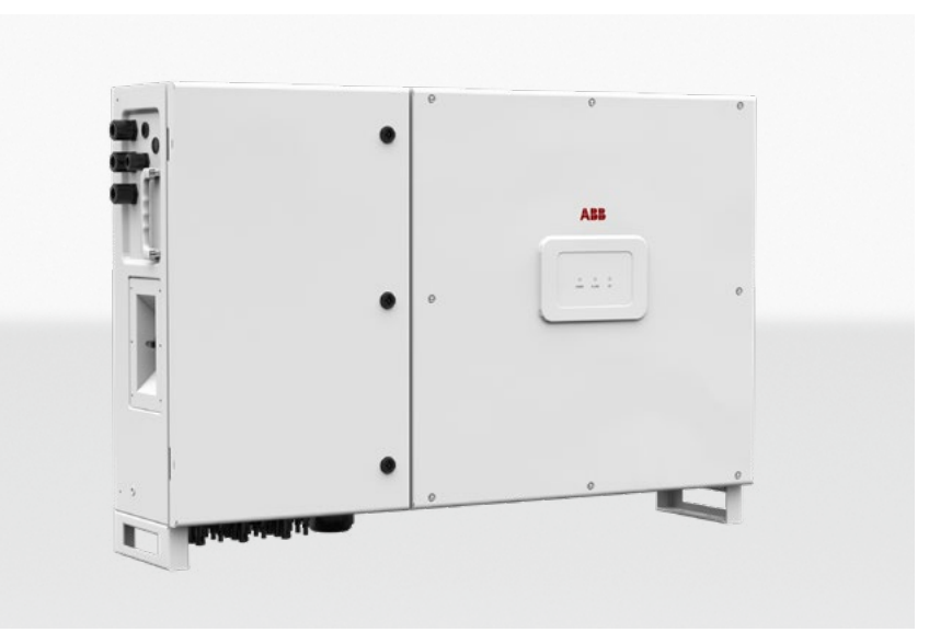
ABB string inverters PVS-50/60-TL

The PVS-50/60-TL is ABB's cloud connected three-phase string solution enabling cost efficient large decentralized photovoltaic systems for both commercial and utility applications.